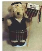
Faithful games participant