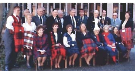
Clan Representatives for 2003 Kirkin.

26, 2003 at Sacramento's Fremont Presbyterian Church. Thanks