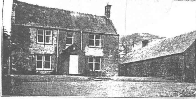
Meikledale Farm - Front View